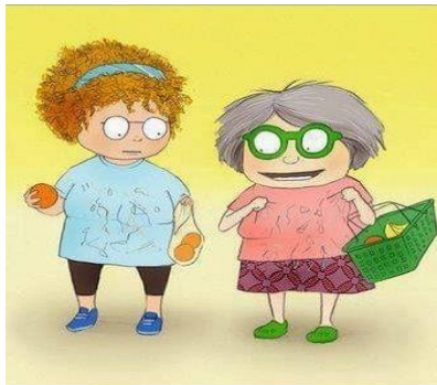
I can tell you're a quilter by the threads on your shirt.

If you need a pattern, let me know. If you are looking for something to keep you busy, I have some things to be made. If you need some completed items picked up and gone, just let me know. In addition, if you need anything, please reach out. This has been a very long stretch and I have no idea when the world will be back to normal. Take care my friends.