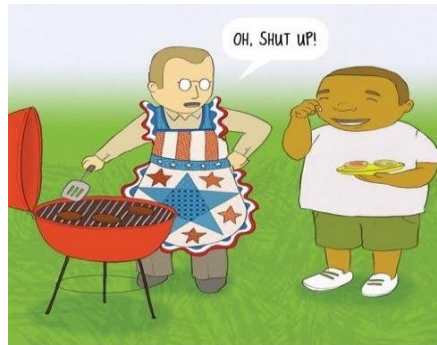
The quilted apron: just another sign that you live with a quilter.